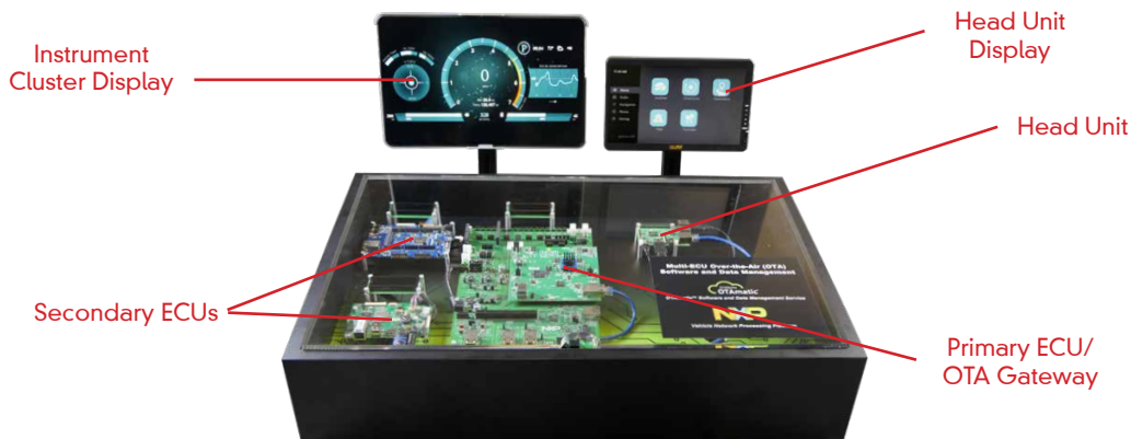
Airbiquity-NXP Automotive-Grade OTA Services with Vehicle Network Processor Demonstrator

The NXP VNP platform brings together real-time OTA gateway processing with significant application processing for high-level operating systems to enable the applications and services that will unlock the full benefits of connected vehicles. VNP supports legacy automotive interfaces (CAN FD, LIN, FlexRay) and meets the demanding high-speed processing requirements for 5G connections and new Gigabit Ethernet vehicle architectures. The VNP automotive-grade platform also provides hardware acceleration for security and industry-first Gigabit Ethernet packet forwarding, with support for ASIL B systems.