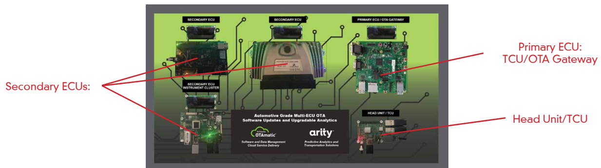
Airbiquity OTA Software and Data Management with Arity Upgradable Analytics Demonstrator

Arity's driving behavior modules provide driver, vehicle, and contextual analytics for a variety of use cases, including usage based insurance, driving behavior, accident prediction, shared mobility analytics, and many others. Arity makes transportation smarter, safer, and more useful by collecting and analyzing massive amounts of data to help partners better predict risk and understand how people move. By balancing edge analytics and cloud processing, Arity is able to capture, process and draw actionable insights from the vehicle in real-time without overburdening data transmission volumes.